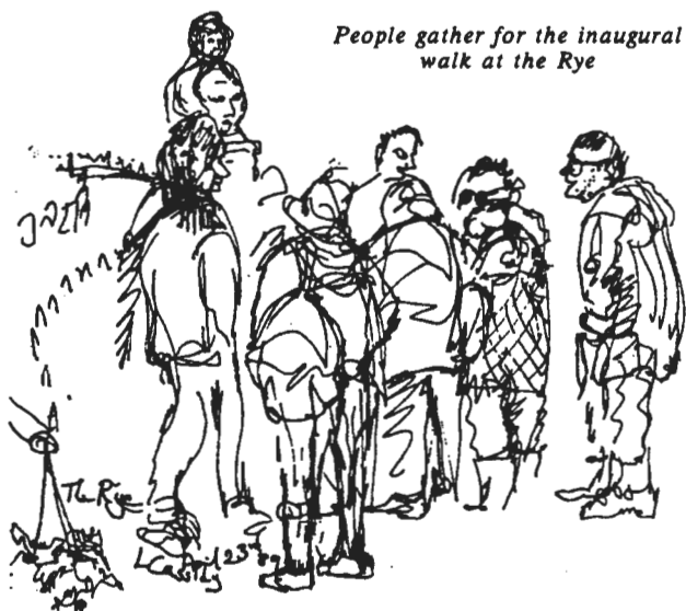
People gather for the inaugural walk at the Rye