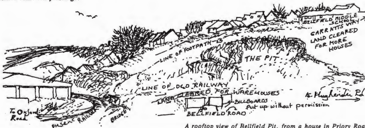
A rooftop view of Bellfield Pit, from a house in Priory Road